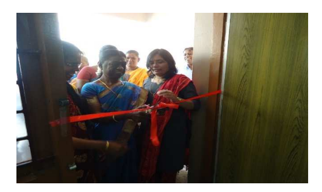
Currently this Centre is running successfully and training about 40 economically backward women in 4 batches.